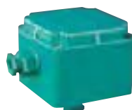
Earth rod box Green only