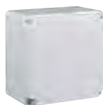
Moulded enclosure unit (Adaptable box)