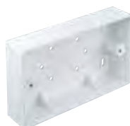
2 gang accessory box Square corners