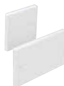
Raised cover plate – raised