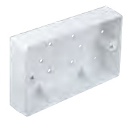
2 gang accessory box Radius corners