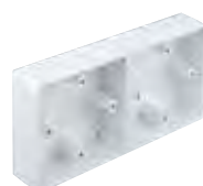
Dual gang accessory box