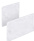
Cover plate – flat