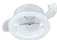
Single back entry 34mm internal depth (white clamps)