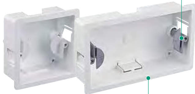
Wide securing flanges