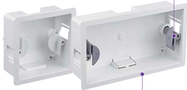
Wide securing flanges