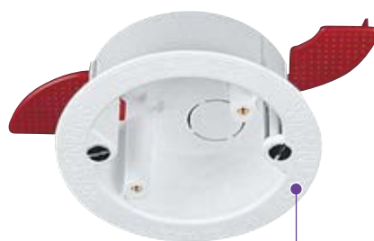
Wide securing flanges

Colour options: Other colours are available but may be subject to minimum order quantities and longer lead times. For further information please contact the Technical Team on +44 (0)1424 856688.