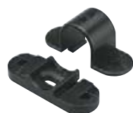
Spacer bar snap saddle LSOH