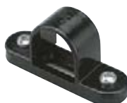
Spacer bar saddle LSOH