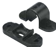
Spacer bar snap saddle