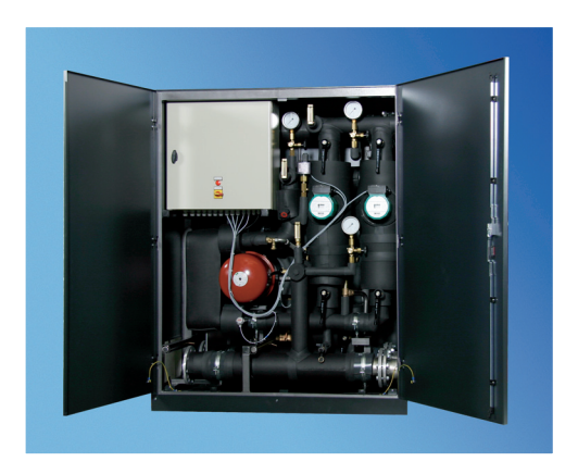
Knürr CoolTrans®100 in modular design. Linking allows heat loads of up to 500 kW to be safely diverted.