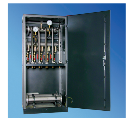
Distributor for connecting up to 5 consumer units, such as Knürr CoolTherm® or Knürr CoolAdd®