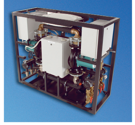
Knürr CoolTrans® in compact 19" construction. Ideal for installation in data centers or IT rooms.